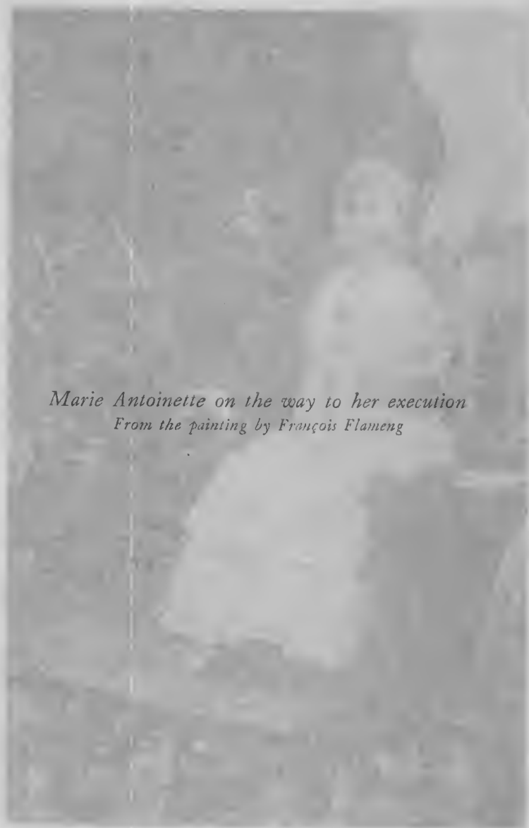
Marie Antoinette on the way to her execution From the painting by François Flameng